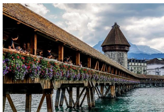
Image: Chapel bridge in Lucerne