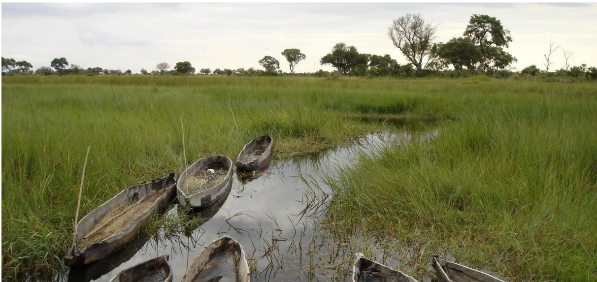
Image: Okavango Delta in Botswana

The project also intends to increase cooperation in a global team of 48 partners from eight world regions. We are especially happy to announce the "1st International and Interdisciplinary Conference on Spatial Methods" ("SMUS Conference") from Thursday 23.09 – Sunday 26.09.2021, hosted by the University of Botswana. Due to the pandemic the conference has to take place online. There are various important sessions about establishing a methodological dialogue with the global south: https://gcsmus.org/conferences/botswana/